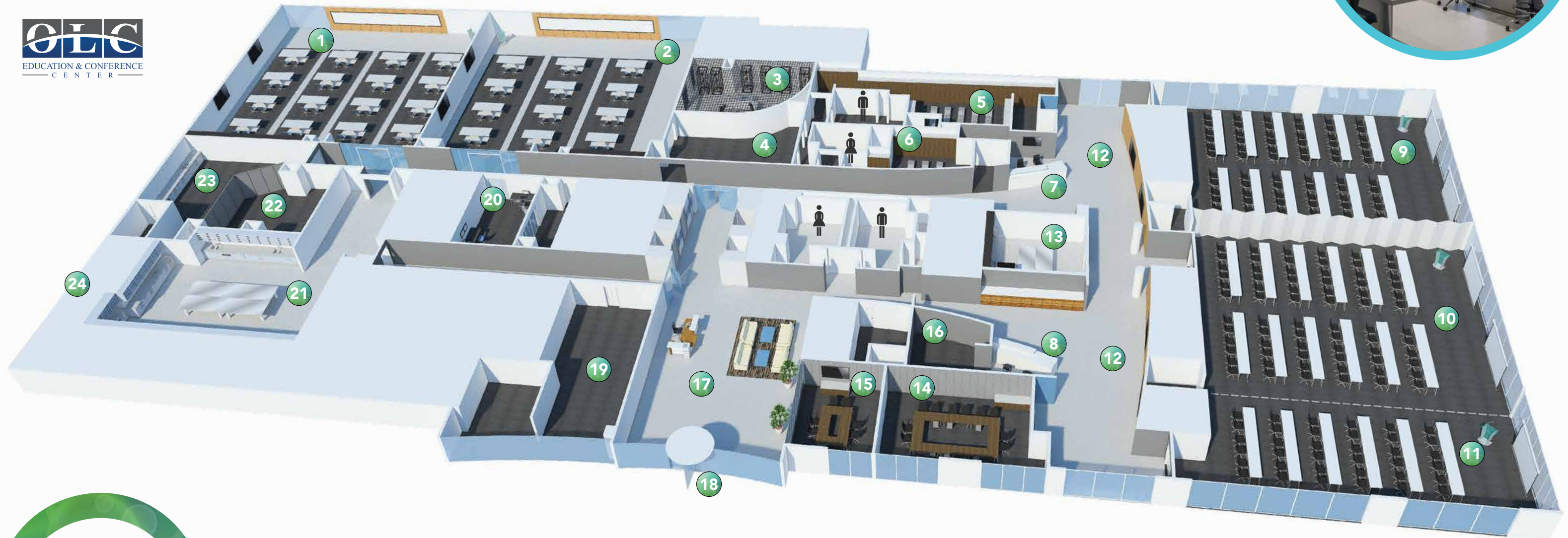
Auditoriums B + C shown combined as Auditorium seating, other layouts available

847.384.4210 | OLCinfo@OLCevents.com | www.olcevents.com